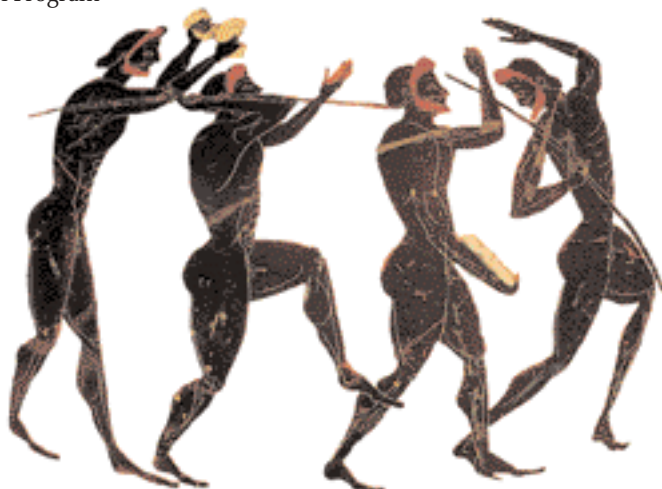
A depiction of the Pentathlon. The Greeks believed in the value of sports as training for warfare and as a way of honoring the gods. Background: a detail of a marble frieze