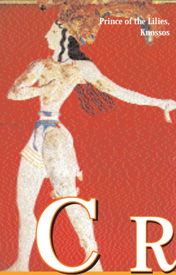
Prince of the Lilies, Knossos