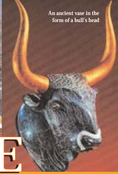
An ancient vase in the form of a bull's head