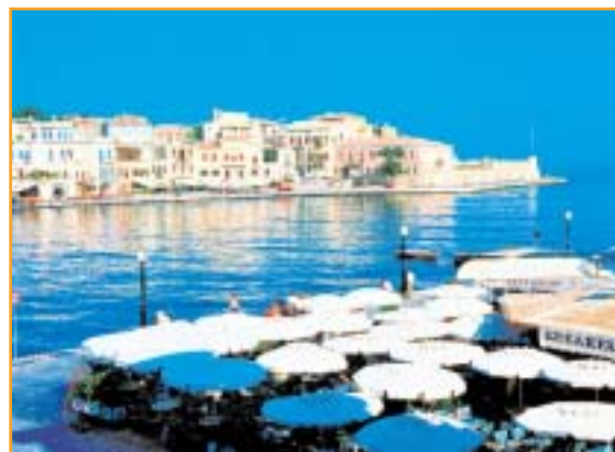
Above: Hania's old port Top: Phaistos Disk

learn about traditional farming methods and enjoy lunch. Then, continue to the seaside town of Rethymno and visit the Fortezza, the 16th-century Venetian fortress overlooking the harbor. Return to Hania in the late afternoon and enjoy an evening at leisure. (B,L)