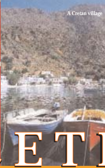
A Cretan village